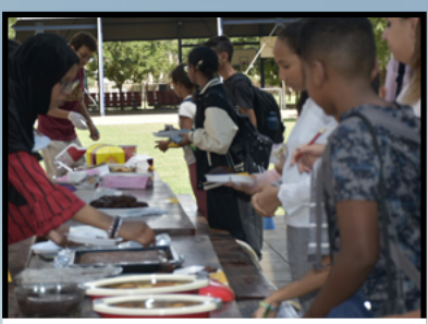
BAKE SALE FUN!