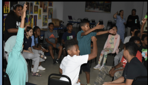
GAME TIME WITH STUDENT COUNCIL